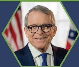
Mike DeWine Governor of Ohio