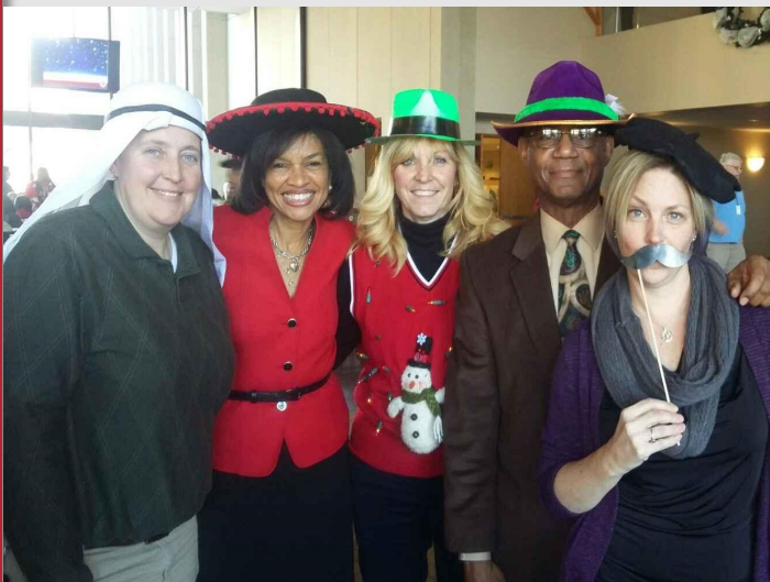
Fun at the Photo Booth