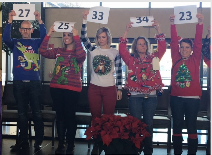
And the winner is.... #34. Staff show off their ugly Christmas sweaters.